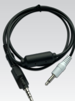
OPT-1x IR Adapter Cable