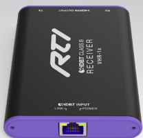
VHR-1x HDBaseT Class B Receiver